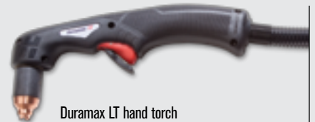
Duramax LT hand torch